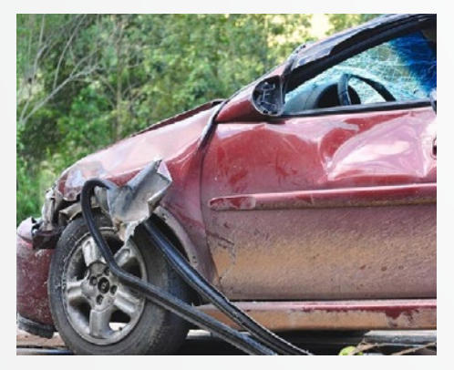
Bilingual Impaired Driving PSA Featuring Local Band, iZCALLi

Last year traffic deaths in Colorado spiked by almost 12 percent and reached 546 fatalities. So far this year, traffic fatalities are trending even higher. There have been 467 fatalities to date. Last year at this time there had been 455 deaths.